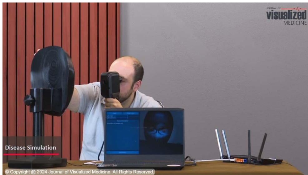
Figure 2. The software simulate different ophthalmologic diseases and clinical scenarios. (Design by Authors, 2024)