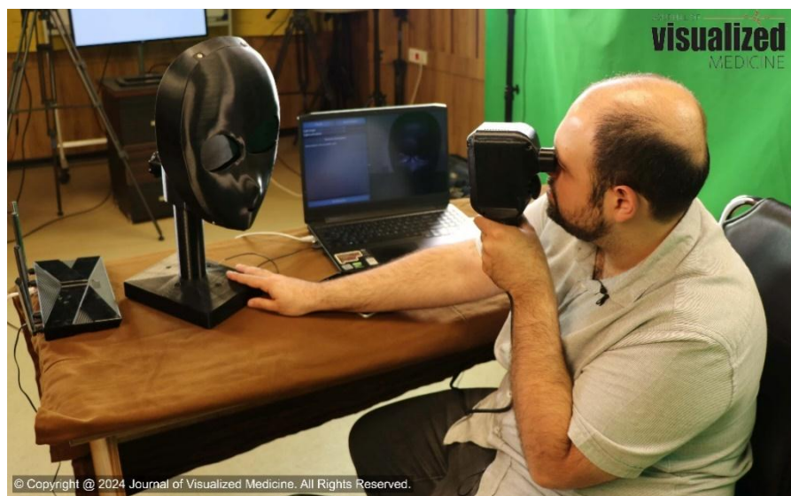
Figure 1. Realistic simulation of direct ophthalmoscopy examination (Design by Authors, 2024)

By following these steps, we ensure that our ophthalmoscopy simulation is, providing users with a realistic experience of examining normal and pathological retinal features (Figure 1-3).